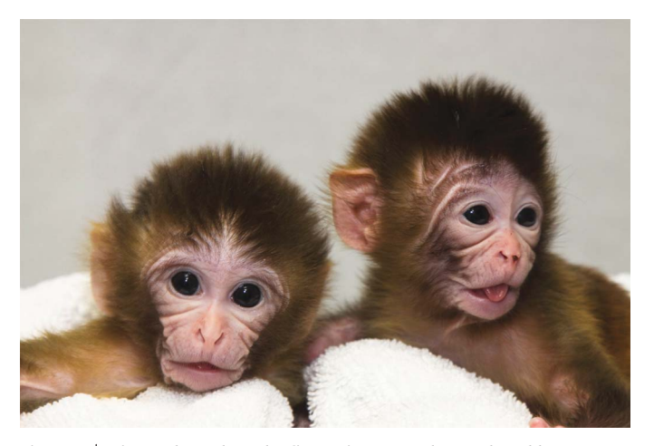
Figure 2 | Mito and Tracker, the first primates to be produced by spindle-chromosomal complex transfer (ST) into enucleated oocytes followed by fertilization and embryo transfer. Twin pregnancy was established by transfer of two ST-derived blastocysts into a recipient. Both infants are healthy and their growth and development is within a normal range for rhesus macaques. The photo was taken at 6 days of age.